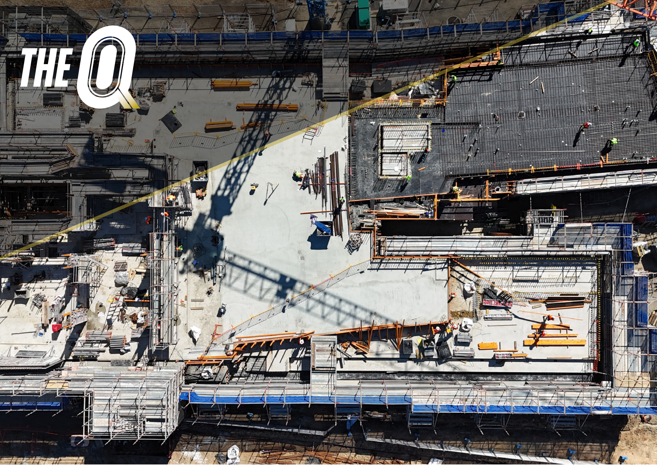
Q2 Parklands & Grandstand